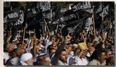
End the Circus of Democracy and Dictatorship