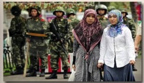
Uyghur Muslim Women Continue To Face Oppression From All Directions!