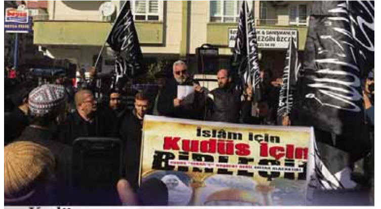
Kudüs "İsrail'i Baskent Değil Mezar Olacaktır!"