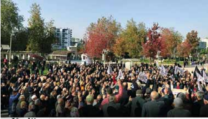
Kudüs "İsrail'i Baskent Değil Mezar Olacaktır!"