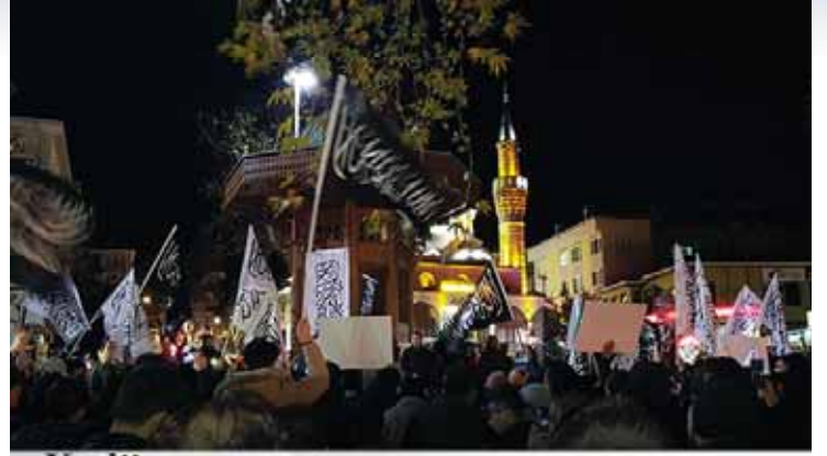
Kudüs "İsrail'i Baskent Değil Mezar Olacaktır!"