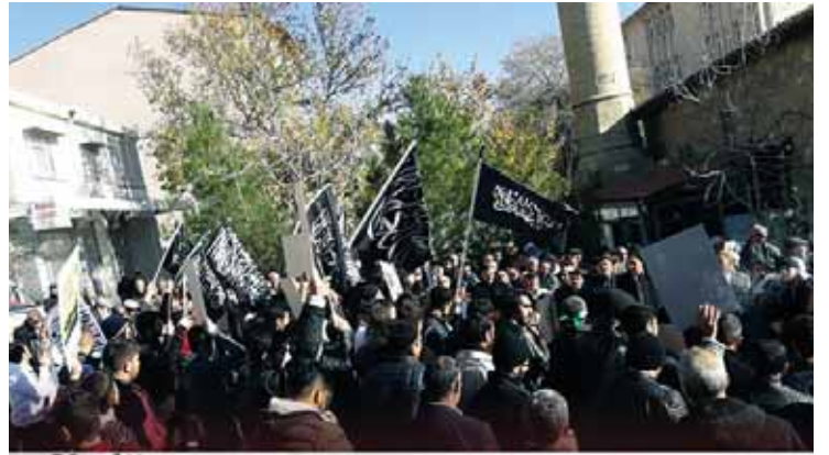
Kudüs "İsrail'i Baskent Değil Mezar Olacaktır!"