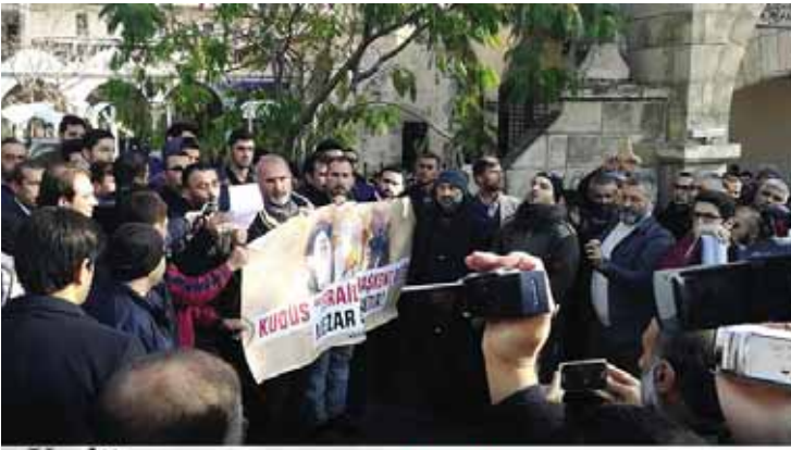
Kudüs "İsrail'i Baskent Değil Mezar Olacaktır!"