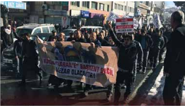
Kudüs "İsrail'i Baskent Değil Mezar Olacaktır!"