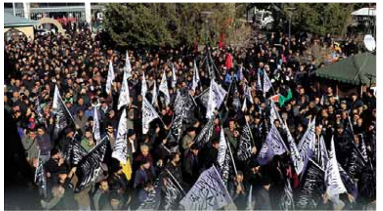
Kudüs "İsrail'i Baskent Değil Mezar Olacaktır!"