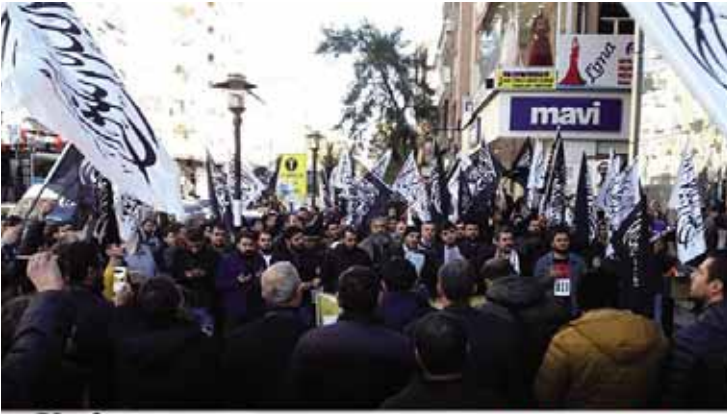
Kudüs "İsrail'i Baskent Değil Mezar Olacaktır!"