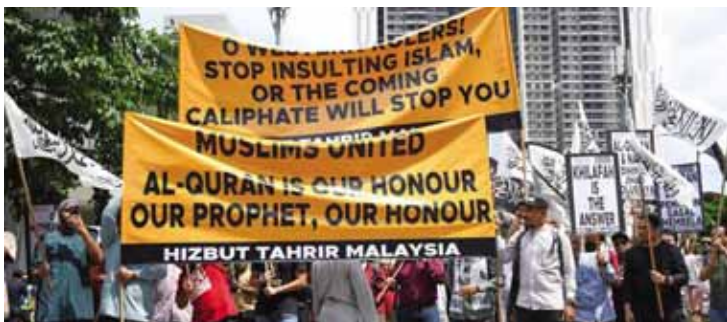
The Shabab are marching to Dutch Embassy after the Friday Prayer.