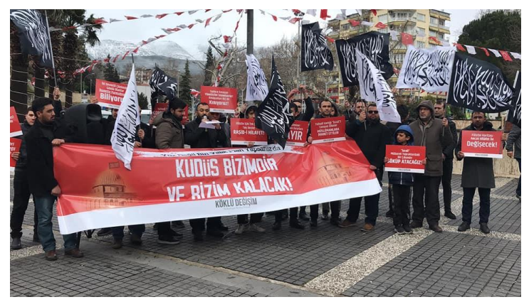
Press release after the Jummah prayer in front of the Kahramanmaraş Ulu Camii/Kahramanmaras.