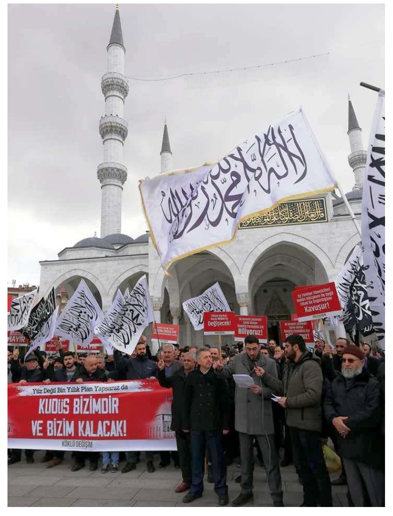
Press release in front of the Melike Hatun Camii/Ankara.