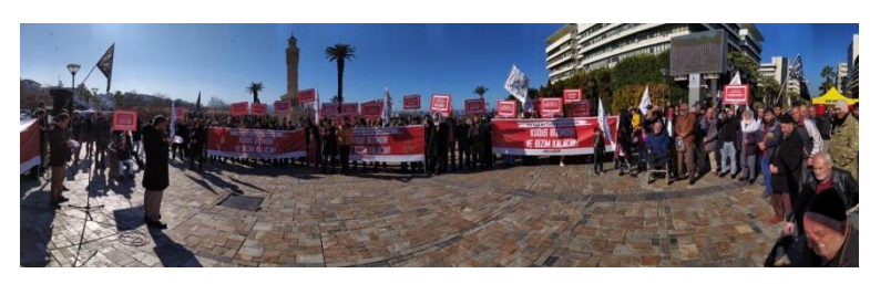
Press release on the Konak Square/Izmir.