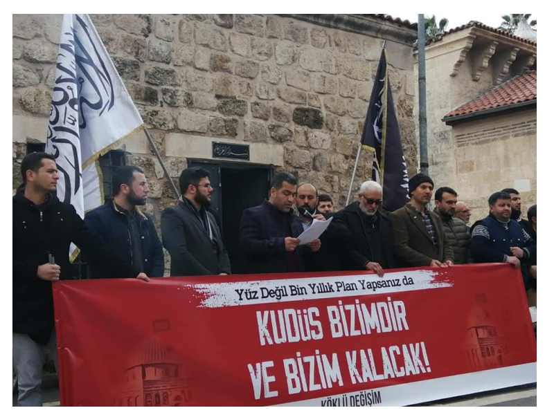
Press release in front of the Ulu Camii/Adana